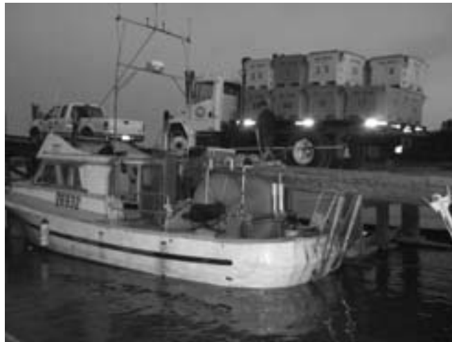
Loading the truck with wild sockeye salmon from our commercial gillnet fleet.

Summer is the perfect time to enjoy the delicious taste of wild salmon. Here at Bruce's we have fresh premium wild Sockeye and red Spring salmon in fillets or whole fish. Scrumptious for any occasion!