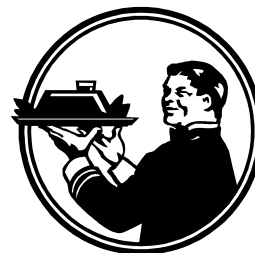
Hot and Sour Prawns with Blueberries coming up!!

Combine prawns, 2 tbsp white wine, and ginger. Cover and refrigerate for 30 minutes. Mix remaining 2 tbsp wine, stock, soy sauce, ketchup, cornstarch, vinegar, sugar, sesame oil and cayenne. Set aside.