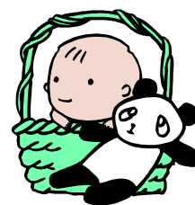
Earth's Best Certified Organic Baby Food – It's the Best!!