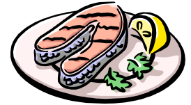
Barbecue, broil or grill this dish for delicious results!