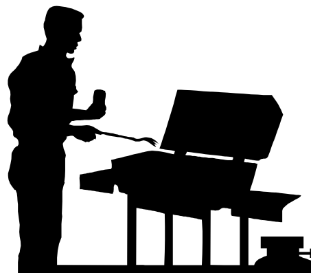
Come and enjoy food and fun with us!

Come and enjoy salmon, salad, a bun and pop for just $6.00 a plate!!